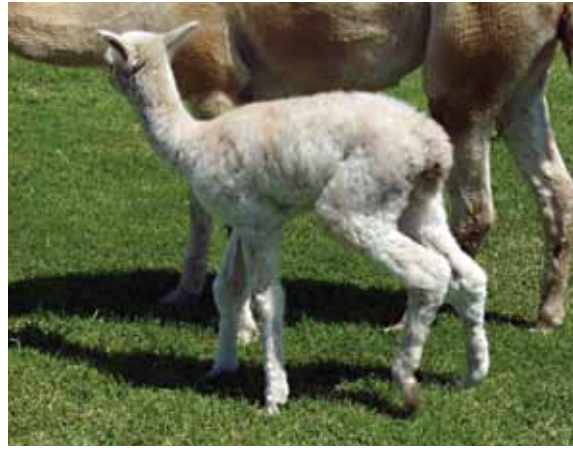
Left, the calm before the storm: Moon River nurses from her dam, Sundance.